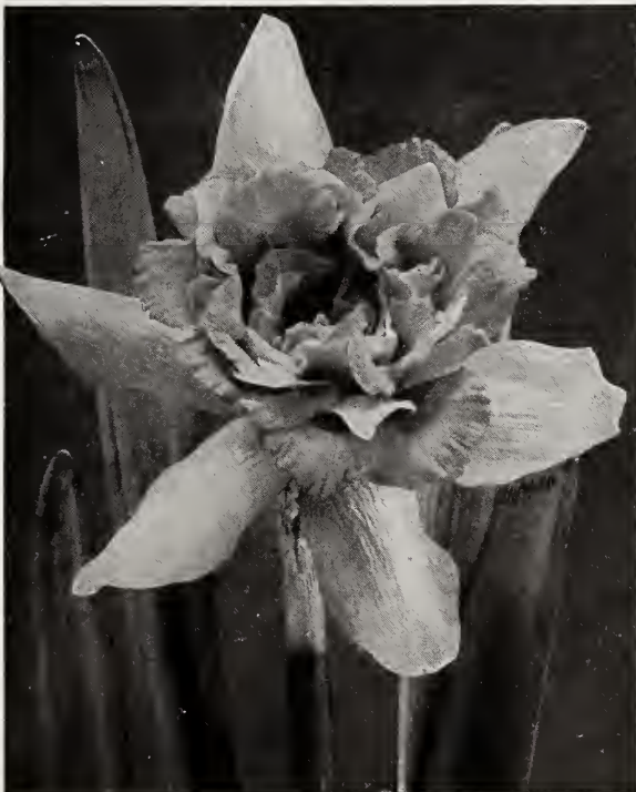
Double Narcissus, Von Sion